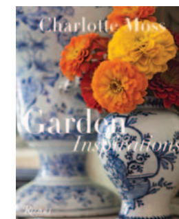
This page: Clockwise from above: Garden Inspirations by Charlotte Moss / Rizzoli / $50 / charlottemoss.com .